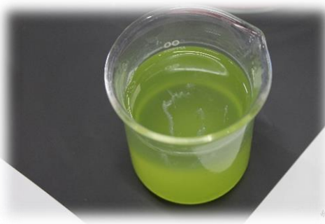
Students observed the Extracted DNA